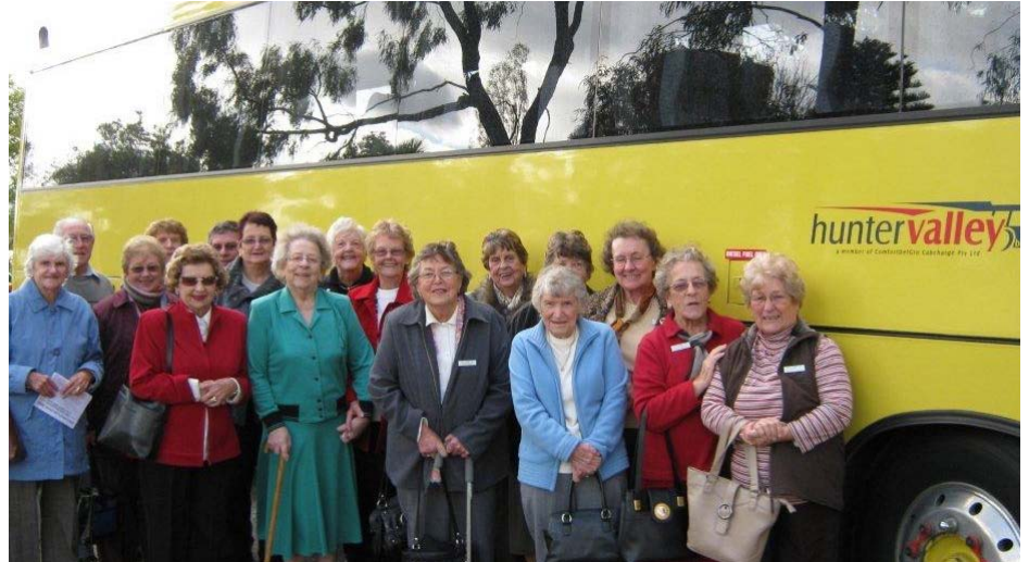
HVB transports Wallsend Ladies Probus.

Hunter Valley Buses travel far & wide specialising in seniors & school groups. Day tours are their speciality and enjoyable days like the one at Aunty Mollys can be arranged and all bookings taken care of for the group. Our coaches are air conditioned, seat belted and have rest room facilities.